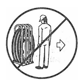
DO NOT STAND IN TRAJECTORY ZONE

Danger: Cage may move in the event of rim separation or other tire failure.