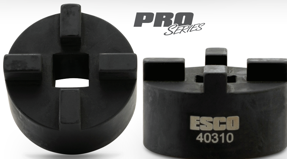
MODEL 40310 1.8 in. Mack King Pin Specialty Socket

Designed to fit the slotted adjusting screw in tapered kingpins.