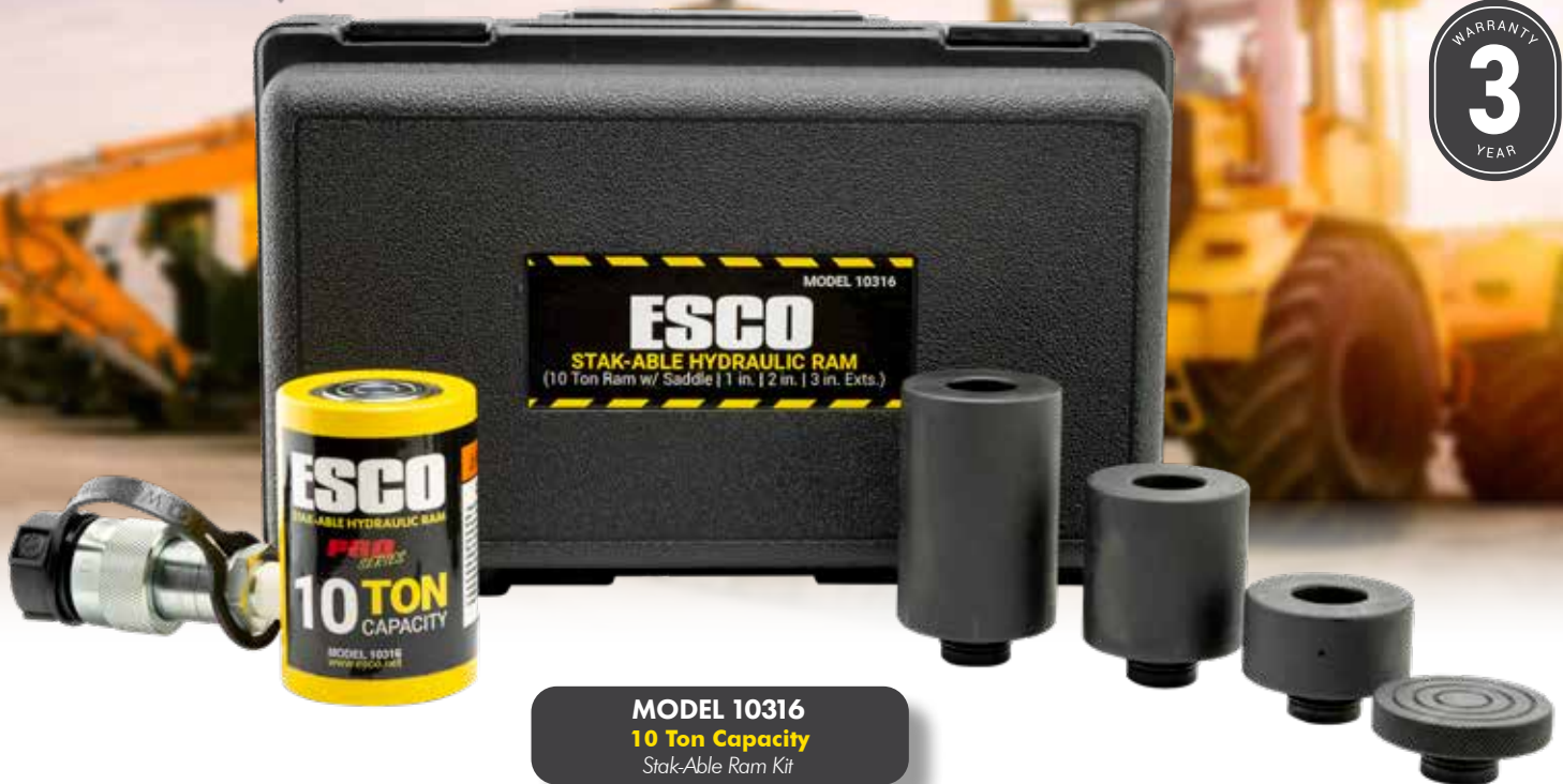
MODEL 10316 10 Ton Capacity Stak-Able Ram Kit