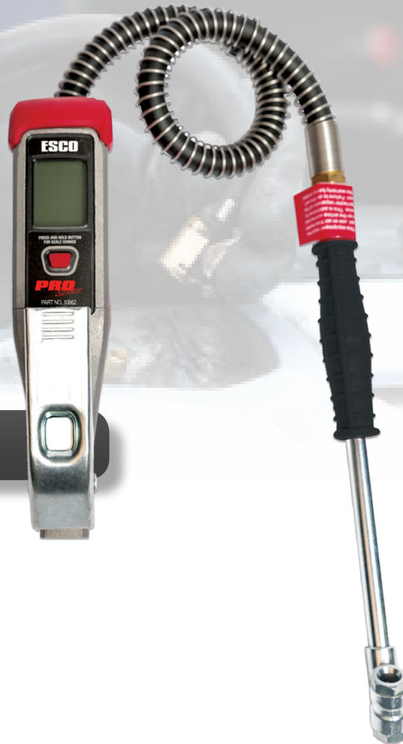
MODEL 10962 "Compact" One Button Tire Inflator