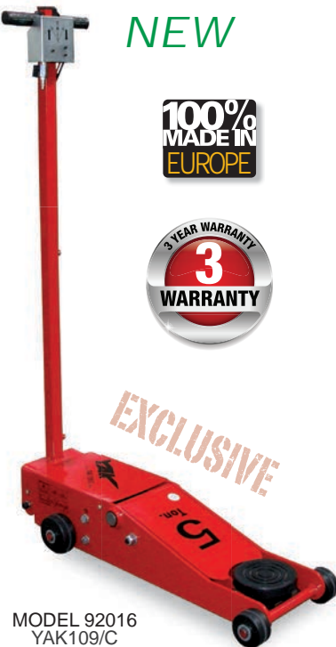
MODEL 92016 YAK109/C