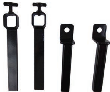
MODEL 70163 For 24" Through 29"