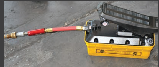
MODEL 10601K being used on ESCO 10500 Hydraulic Pump to regulate air pressure down to the manufacturer suggested 110 psi.